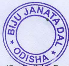
(Seal of the Party)